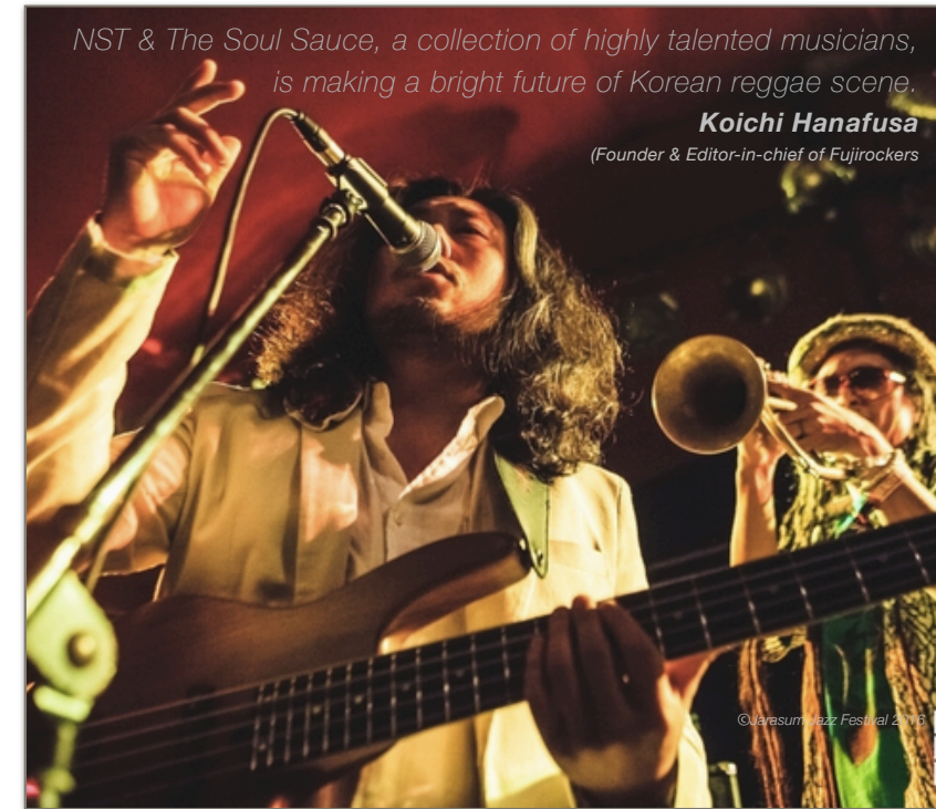
NST & The Soul Sauce, a collection of highly talented musicians, is making a bright future of Korean reggae scene.

NST & The Soul Sauce will release their new full length album worldwide in June and kick off both domestic and international tours for 2017 including Sierra Nevada World Music Festival (U.S.A.)and CirculArt (Columbia)