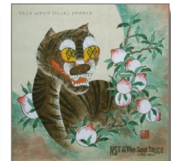
BACK WHEN TIGERS SMOKED (CD/LP) (Eastern Standard Sounds, 2017)