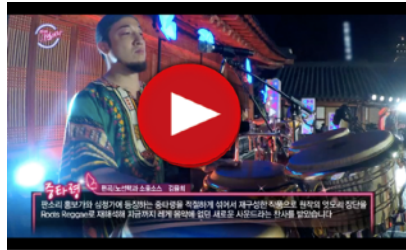
MONK SONG KBS TV 나빌레라 (8.2017)