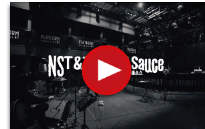
RIDIGN A JORANG HORSE MAKING FILM 2.2017