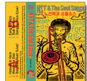
SONG FOR RICO / HEAVEN IS HEAVEN 2016 ( 7INCH, MC)