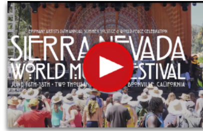
RED TIGER AT SIERRA NEVADA WORLD MUSIC FESTIVAL (6.2017)